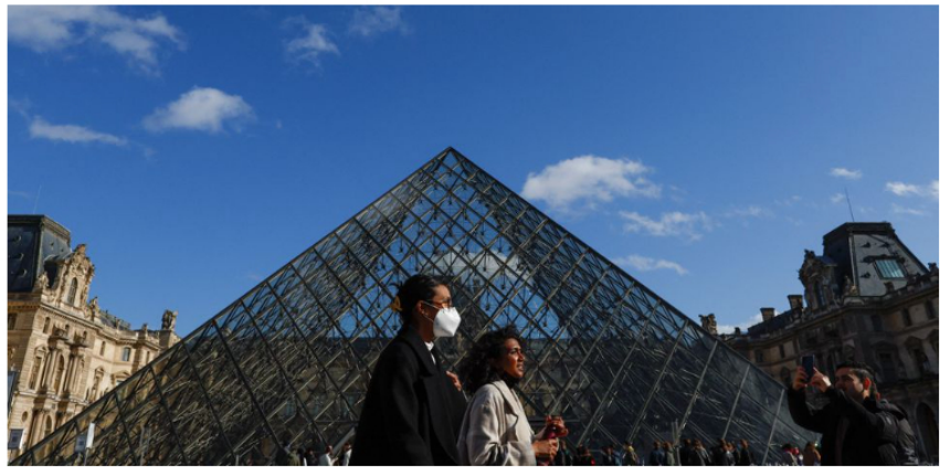
People wearing protective face masks walk near the glass Pyramid of the Louvre museum in Paris, amid the coronavirus disease (COVID-19) outbreak in France, February 19, 2022.

PARIS, Oct 4 (Reuters) - France has entered an eighth wave of the COVID-19 virus, as the winter season approaches, said a leading French health official.